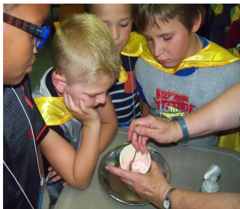
VBS "Hero Central" Science Experiment

Parents, your children will begin in the Sanctuary with you and will go together to the LOWER LEVEL for DEEP BLUE for their own worship, offering, teaching, and experiential time AFTER the Children's Message. Please pick up your child(ren) in the LOWER LEVEL within 10 minutes after the Worship Service is over.